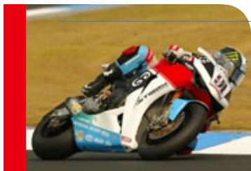
Leon Haslam World Superbike Championship