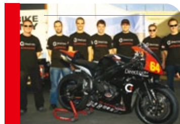
Direct CCTV Racedays team European Superstock 600