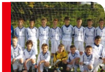
Archdale's 73 FC U13 football team based in Worcester